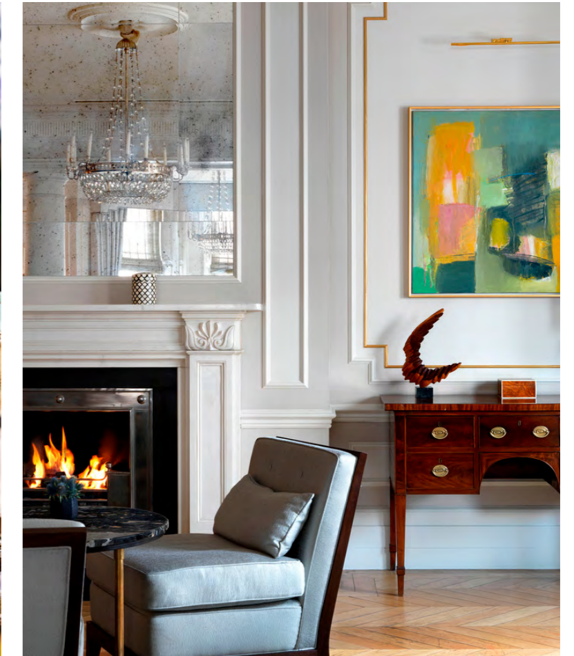
The hotel's Drawing Rooms provide a naturally charming setting for enjoying afternoon tea while Town House provides a chic and elegant atmosphere for all-day fine dining.