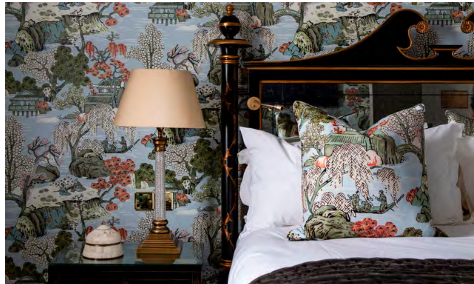
Historic charm meets modern comforts in The Kensington's 116 guest rooms. A bright colour palette and floral and toile patterned wallpaper and fabrics complement the property's original Victorian town-house architecture while introducing a bold and contemporary design.