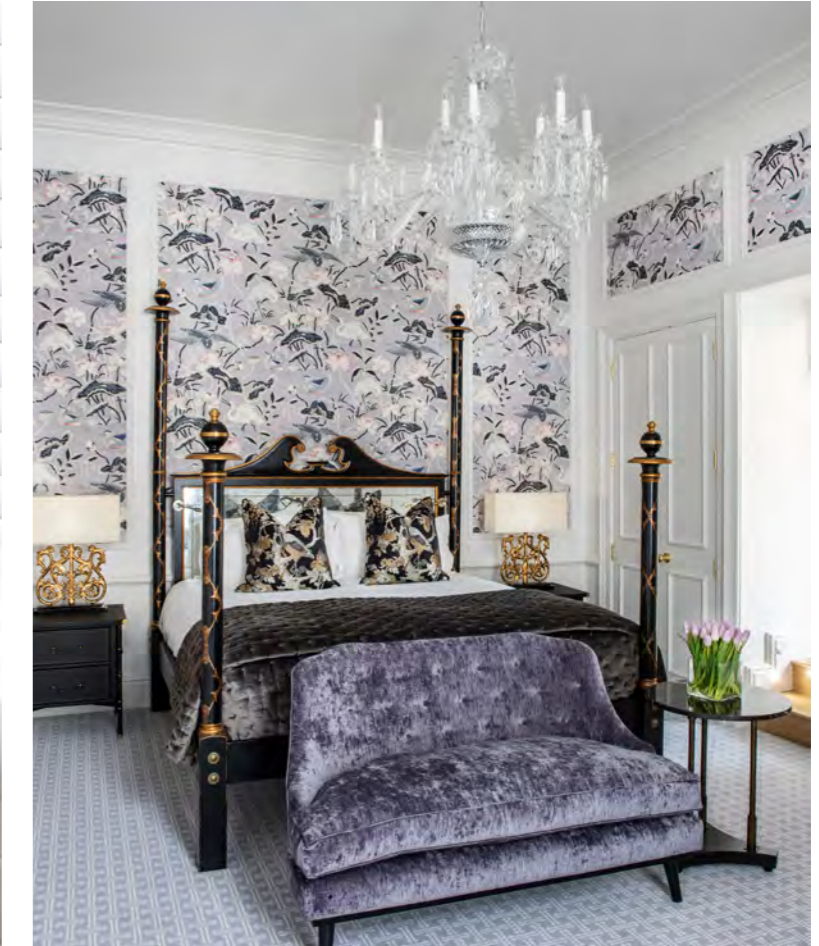
An exquisite blend of period charm and refined luxury, The Kensington's 30 suites reflect the epitome of timeless glamour, offering a private oasis of convenience and tranquility within the vibrant London landscape.