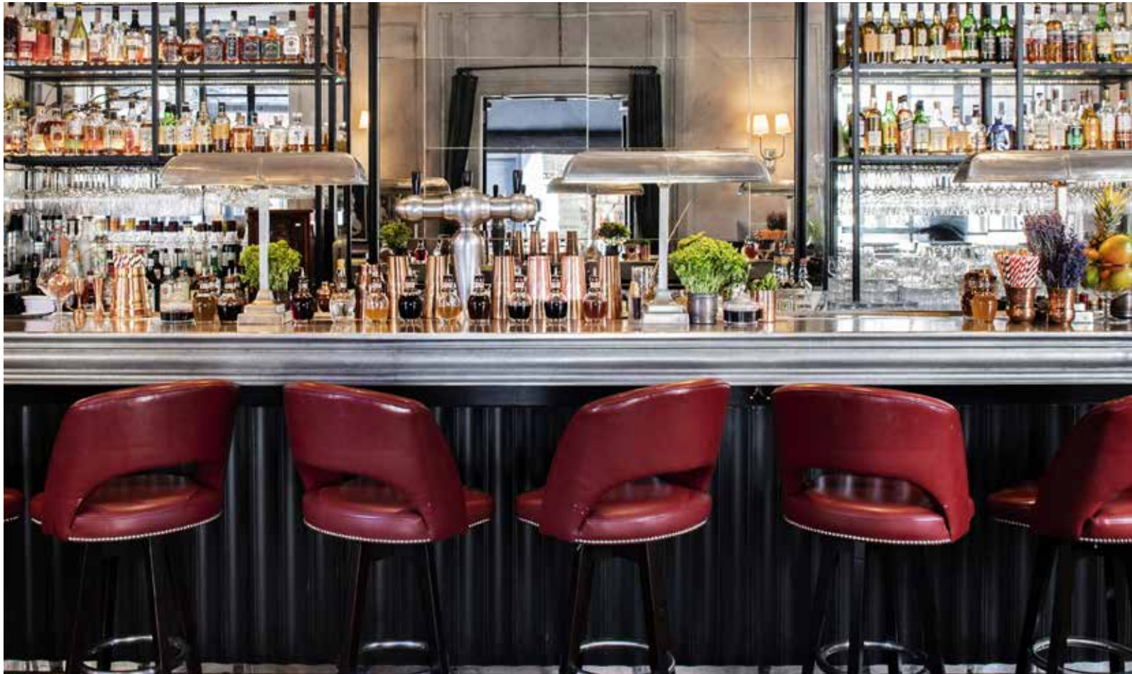
Oozing local charm and buzz, 108 Brasserie, a popular neighbourhood indoor-outdoor restaurant offers delicious contemporary dining while a great gin selection, including its very own 108 Gin and world wines are to be discovered in 108 Bar.