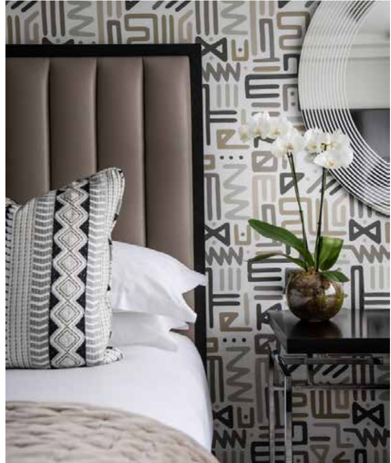
Elegant guest rooms offering soothing, stylish décor and striking Italian marble bathrooms, effortlessly combine luxury and contemporary comfort.