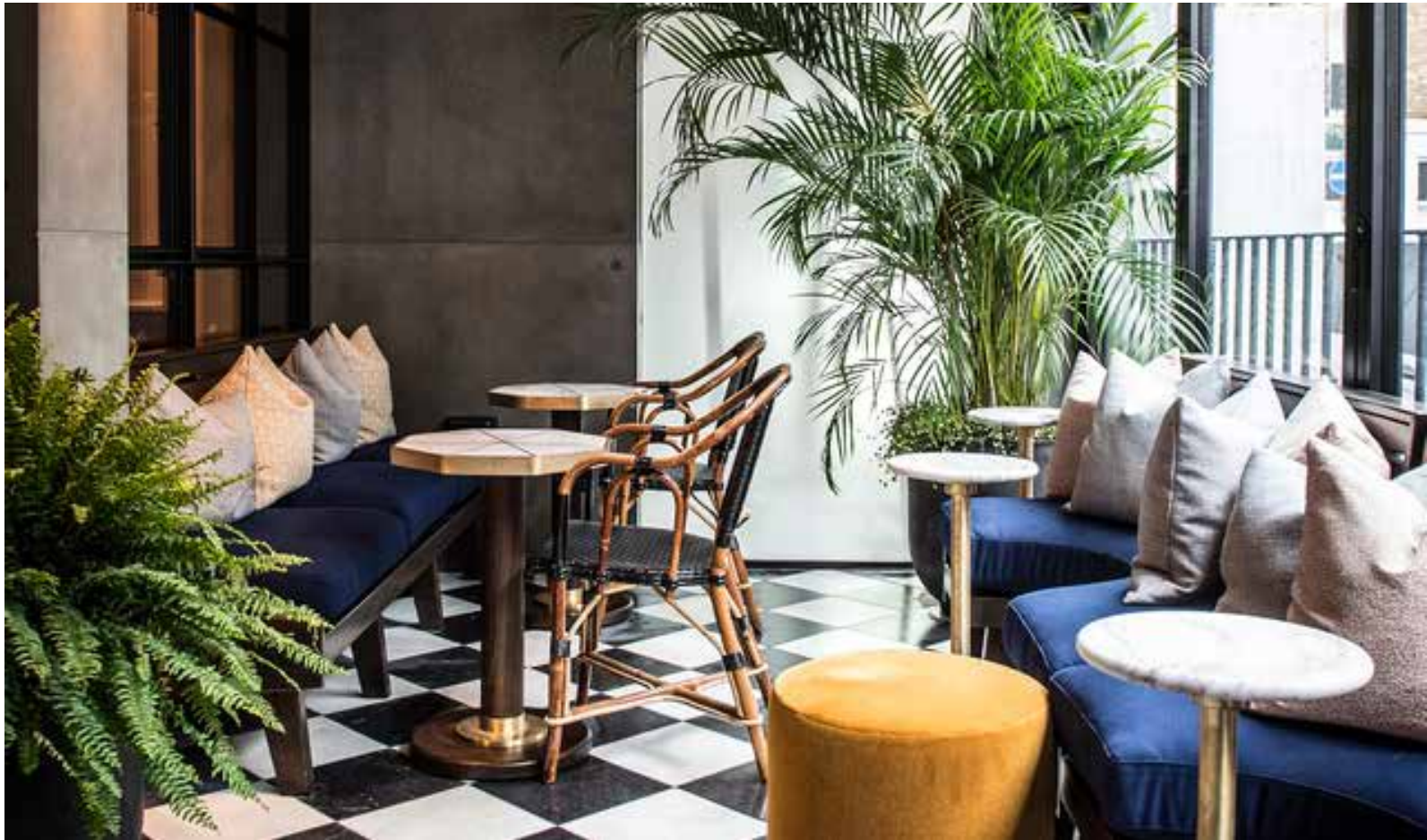
An array of creative and traditional cocktails may be enjoyed in the chic Cocktail Bar - characterised by its inviting nooks and crannies and playful, elegant terrace