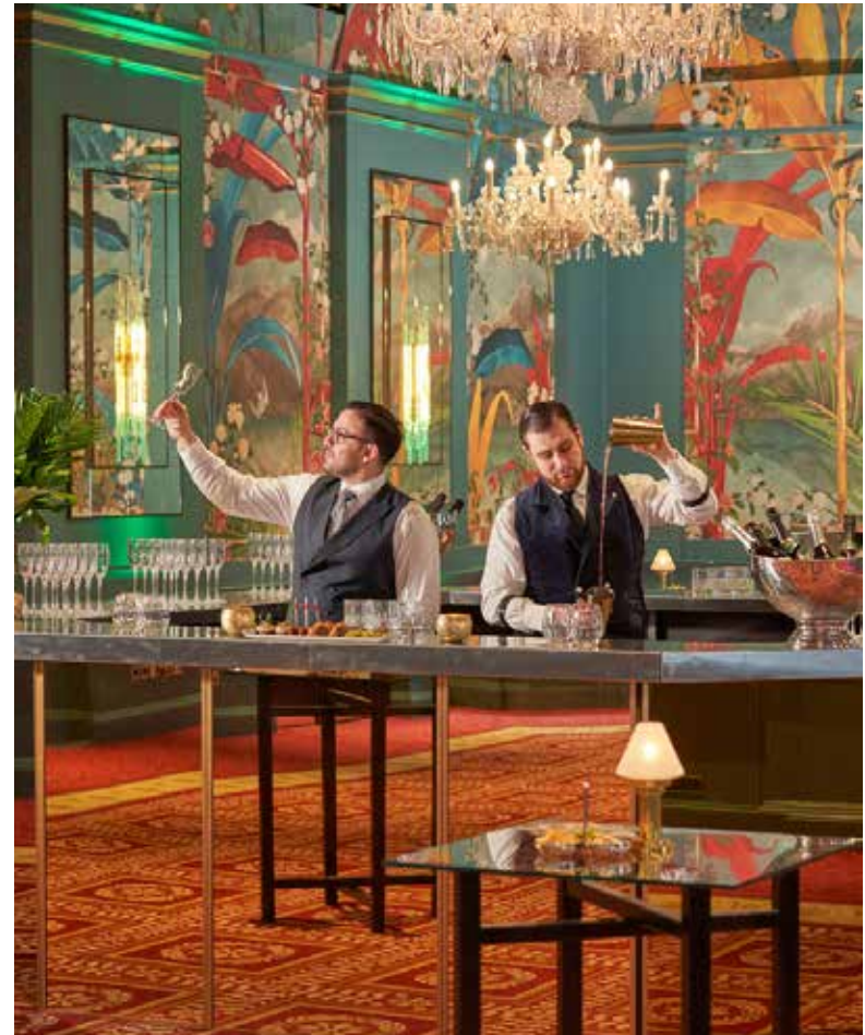
Complementing the grace of The Bloomsbury are its unique meeting and event spaces including the George V Hall and Queen Mary Hall - stately ballrooms with lofty ceilings and Waterford Crystal chandeliers; the iconic Chapel and the intimate, book-lined Seamus Heaney Library, named after the late Nobel Laureate.