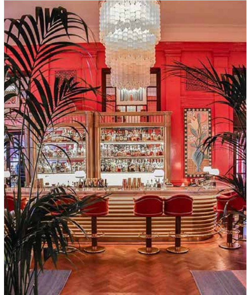
This stylish grand salon bar, inspired by 1920s' glamour, was designed in collaboration with the acclaimed Martin Brudnizki Design Studio. With vivid coral-coloured walls, Murano glass chandeliers and stunning marble bar, it offers the perfect backdrop for all-day dining, and transforms gracefully into a buzzing evening cocktail bar.