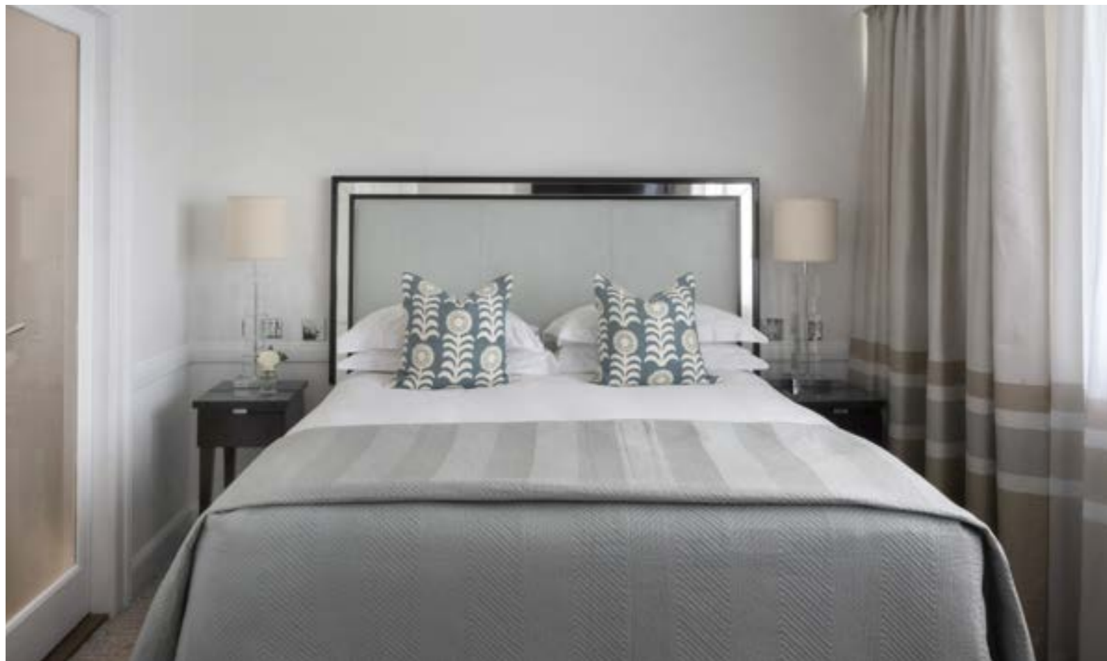
Decorated with a palette of soft natural tones, our stylishly appointed one bedroom suites offer lovely waterfront views and additional comforts to make your stay extra special.