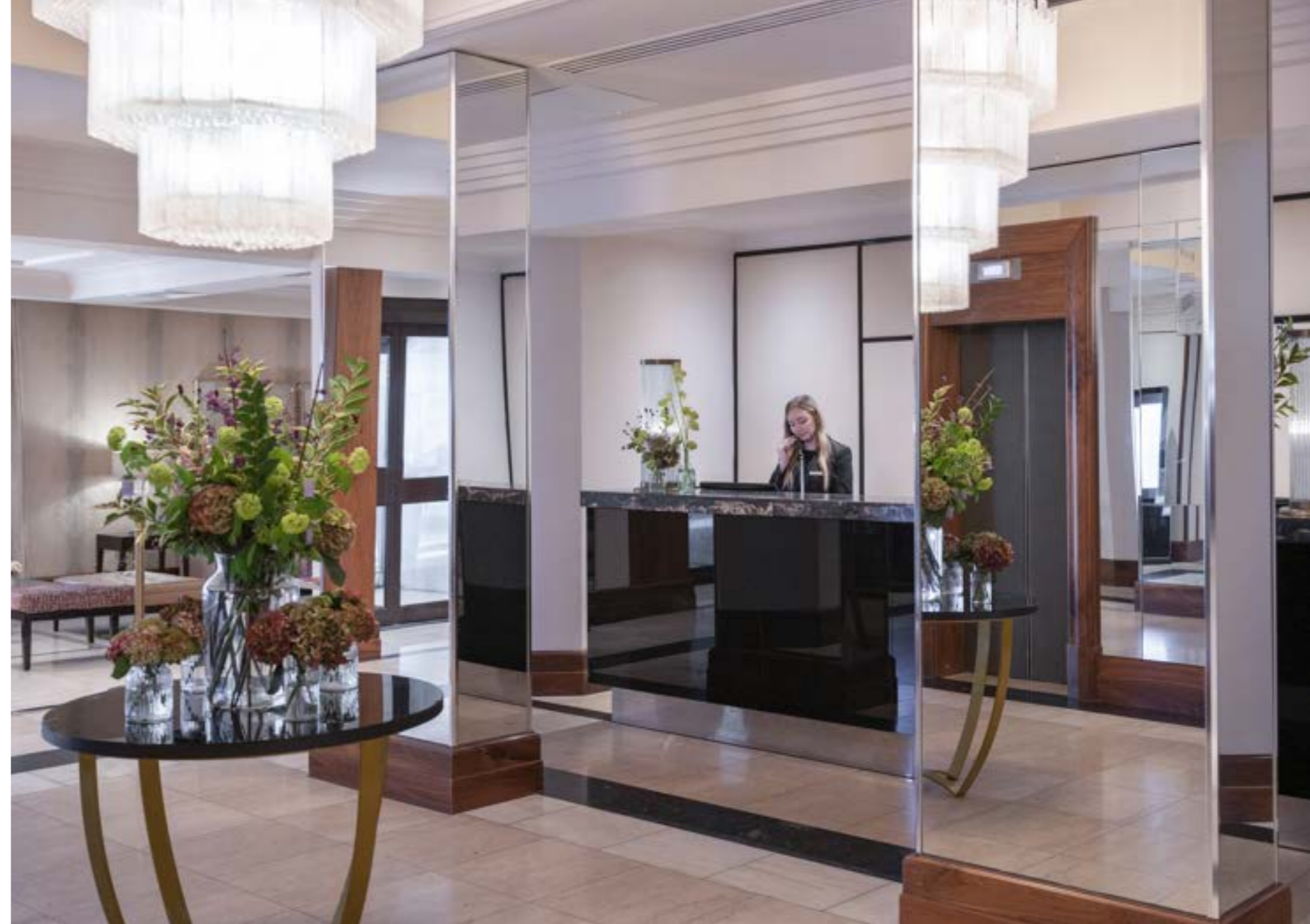
The lobby harks back to the Art Deco and Nouveau grandeur of a grand ocean liner. Guests are welcomed under a vintage Murano chandelier and mirror-lined walls.